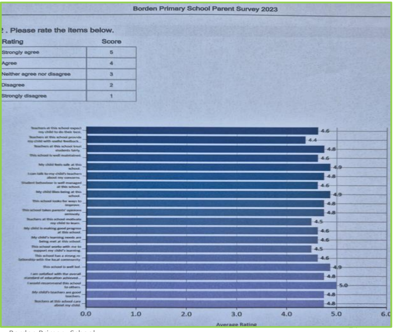
Borden Primary School